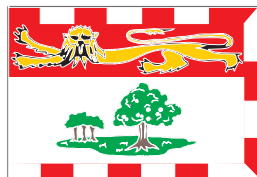
Prince Edward Island