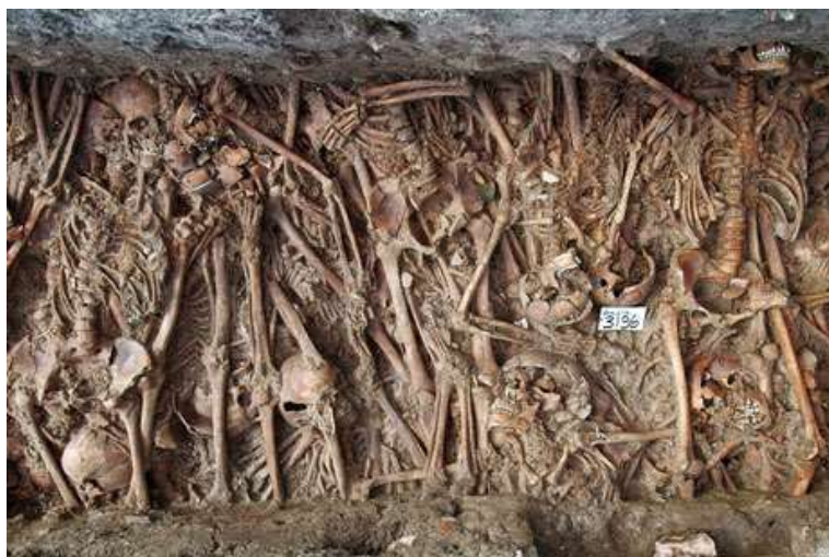
A mass grave for plague victims recently found in Italy